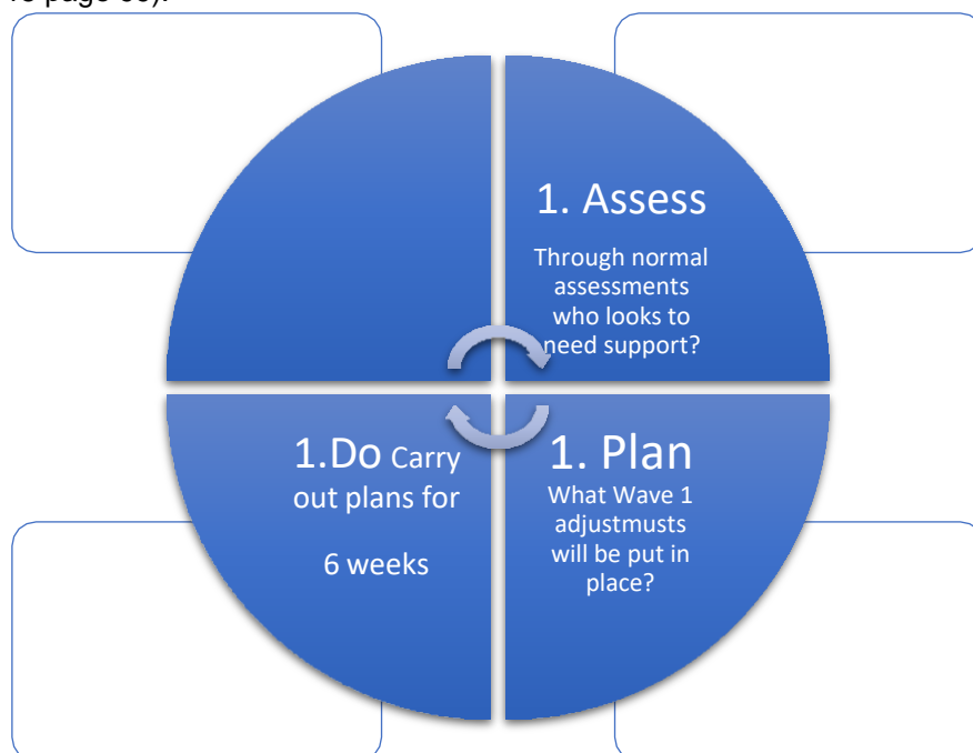
Figure 1: The Graduated approach to the Assess Plan Do Review Cycle. Universal, Targeted (2) and Specialist (3)

Teachers are responsible and accountable for the progress and development of the pupils in their class, including where pupils access support from teaching assistants or specialist staff. (SEND Code of Practice 2015 page 99).