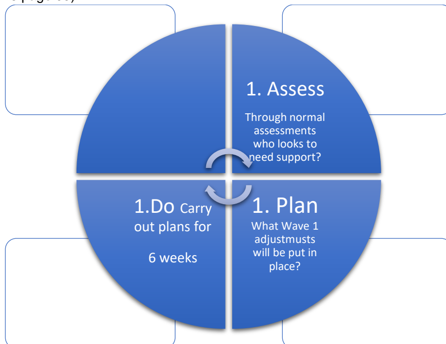
Figure 1: The Graduated approach to the Assess Plan Do Review Cycle. Universal, Targeted (2) and Specialist (3)

Teachers are responsible and accountable for the progress and development of the pupils in their class, including where pupils access support from teaching assistants or specialist staff. (SEND Code of Practice 2015 page 99).